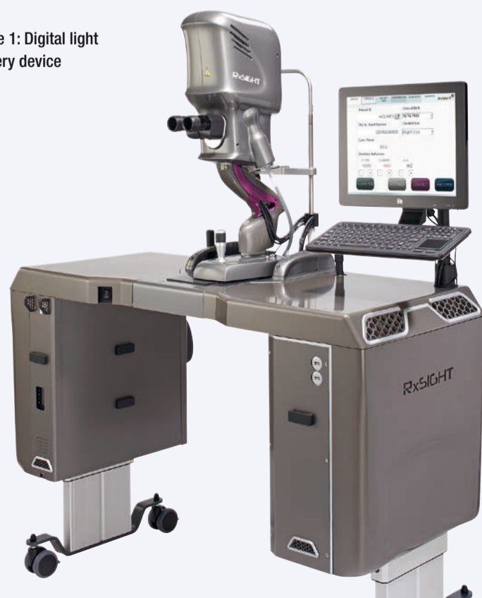
Figure 1: Digital light delivery device

Perhaps the most overlooked benefit will be how much adjustable IOL technology will improve the patient's experience. The anxiety and stress of selecting their IOL and refractive goal preoperatively will be alleviated by allowing patients to choose and prioritize their refractive objectives postoperatively. Using a phoropter, loose trial lenses, or trial soft contact lenses,